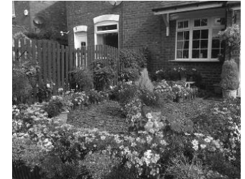
Pictured above the winning private garden

Gold Greenbank Farm, Davenport Lane Silver Railway Inn, Station Road Bronze The Bulls Head, Mill Lane