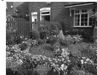
Pictured above the winning private garden